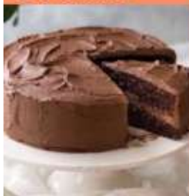
Chocolate Layer Cakes