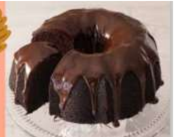
Chocolate Bundt Cakes