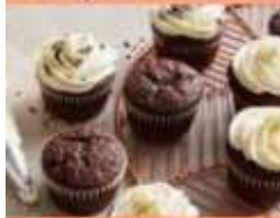
German Chocolate Cupcakes w/ cream cheese icing