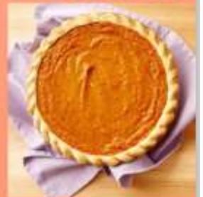
Sweet PotatoPies large & small

St. Joseph Catholic Church 140 W. Government St. Pensacola, FL 32502