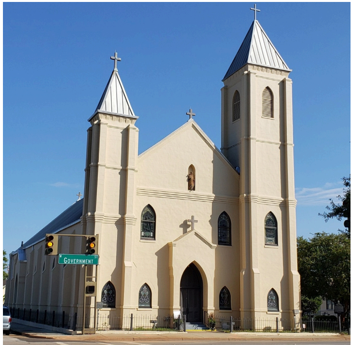
ST. JOSEPH CATHOLIC CHURCH