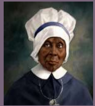
Mother Mary Lange