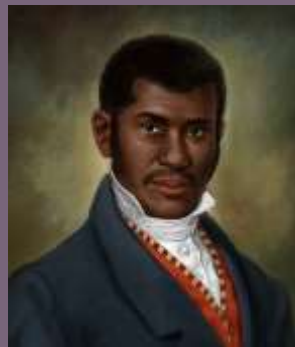
Venerable Pierre Toussaint