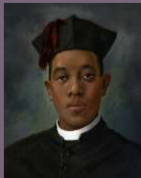
Father Augustus Tolton