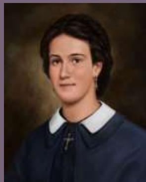
Venerable Henriette Delille