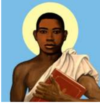
St. Charles Lwanga