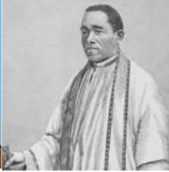
Ven. Augustus Tolton