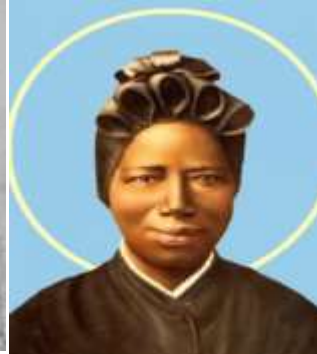
St. Josephine Bakhita