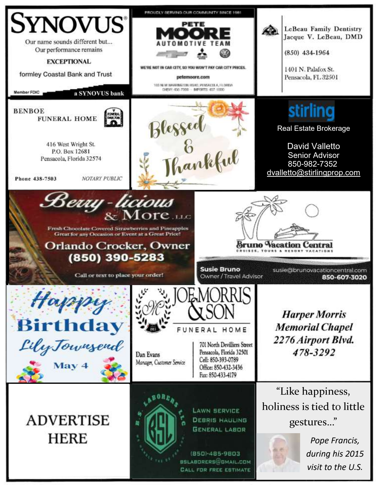
(Please patronize our advertisers and thank them for their ad.)