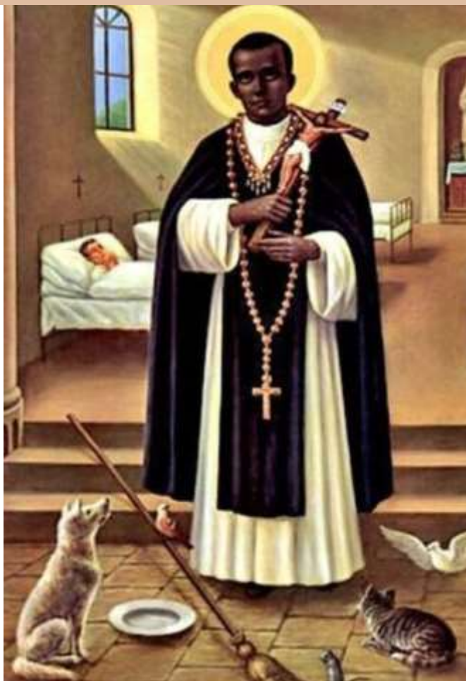
St. Martin de Porres

We welcome you to St. Joseph Catholic Church. If you are new to this area or are returning to the practice of our Catholic faith, we welcome you to our Parish. Please call or stop by the office so we can meet you. If you are a visitor, thank you for joining us. Please sign our Visitor book located in the back of the Church.